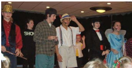
Pinocchio cast takes a well-deserved bow.

Have you ever heard of Pinocchio? Butler Catholic’s annual school play is ‘Hey Ho, Pinocchio!’